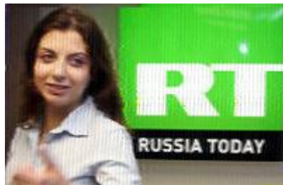
Cuba, Raúl, 0930