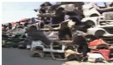
Germany, Roger , 1600