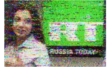
Japan, TW , 1930